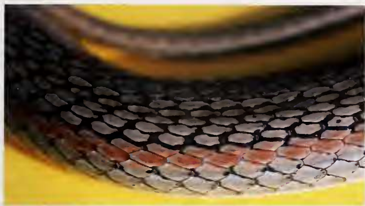
Fig. 23. Psammophis cf. phillipsi from Pendjari NP, showing the characteristic reddish dorsilateral stripes.

Scaphiophis albopunctatus – Bocage (1895, 1896): Ajuda; Chabanaud (1916): “Dahomey”; Chabanaud (1917a): Agouagon; Broadley (1994): Parakou, and Segbana; this paper: Lama Forest (Didja).